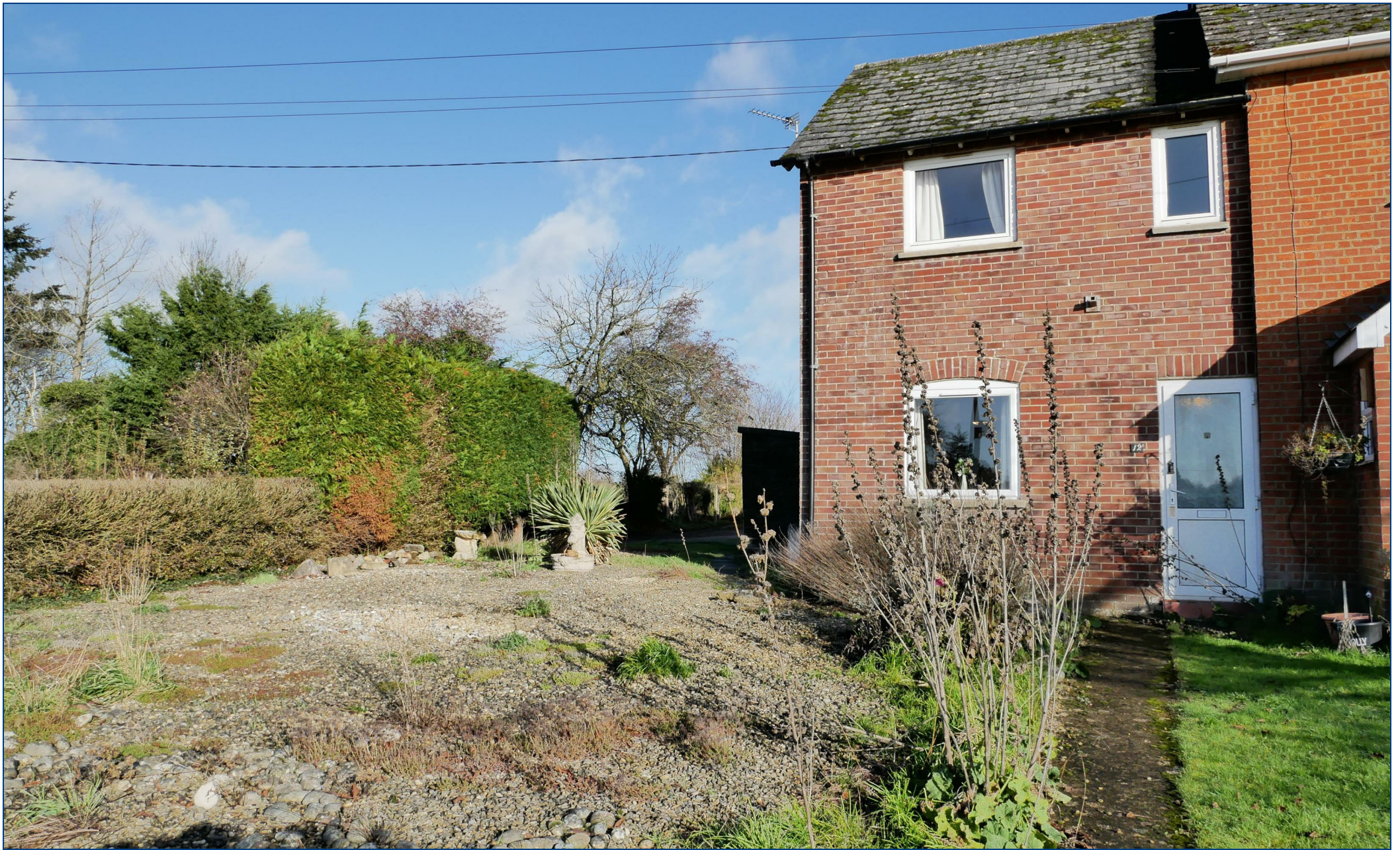
Horsepool, Bromham £295,000